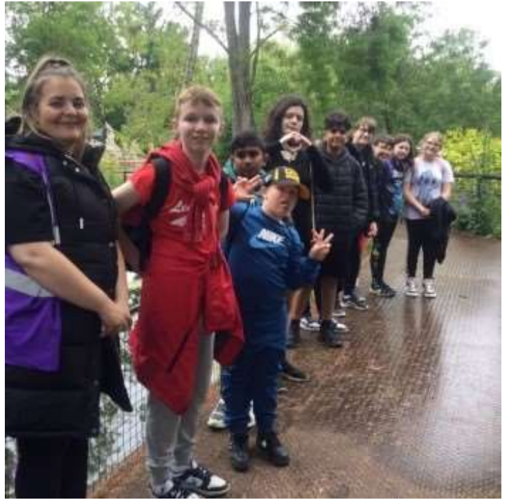
Fletcher Class enjoying their end of year school trip to Beale Park.