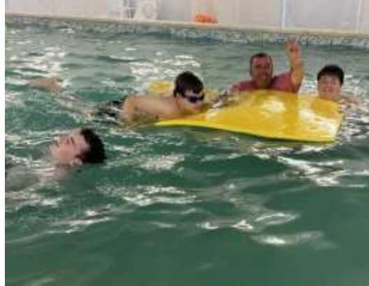
Fun times in the pool