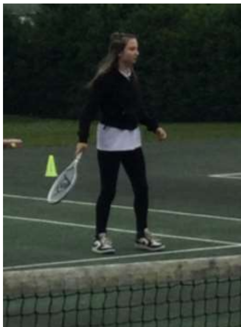
Tennis sessions at Purley Tennis Club