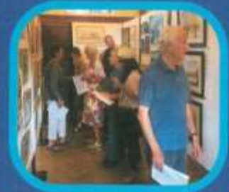
Art & Craft Exhibition