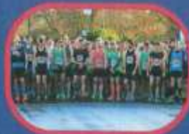
Woodcote 10K Race

In addition to these events our members marshal firework events, help at the Reading Food Bank and support many local charities