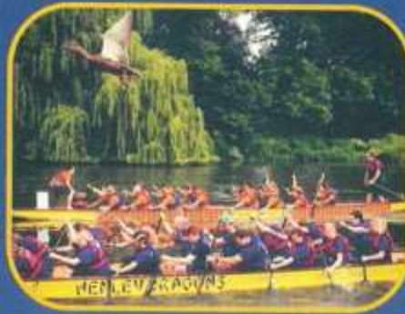
Dragon Boats Races